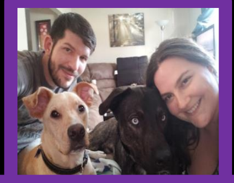
Arya Jon Snow

Special thanks to Arya and Jon Snow for donating their humans for the day – the pups stayed home for the good of our event so that their humans could take lots of great photos for us.