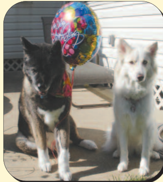
Sheba (left), with Sasha

Sheba, a gorgeous Akita, considered everyone her friend. Sheba enjoyed the dog park and was 13 years young when she crossed over the Rainbow Bridge.