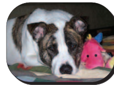
A Four-Legged Getaway Kristi R (Max)

We received several variations of the three-word string similar to Wag Sniff Play and several variations using unleash/leashless , etc.