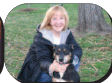
Where Everybody Knows Your Dog's Name