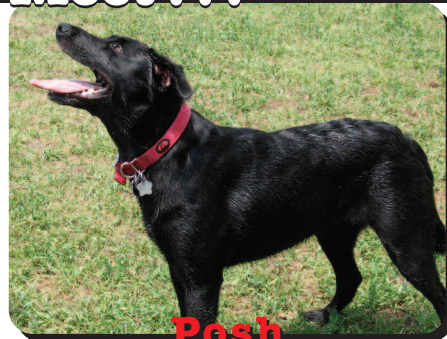
Posh is focused on The Ball.

Posh is a two-year-old lab mix with endless energy! Posh and owner, Becky, have been together since September.