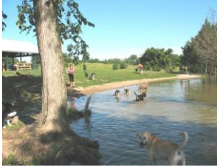
Willow's fav dog park (after SWCDP, of course!)

Saturday, September 22, 8:30am – 10:30am Broemmelsiek Dog Park