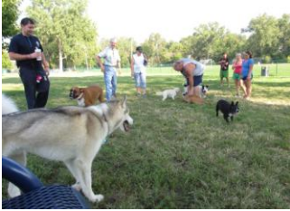
Koda, Marx, Lucy, Dexter, Rex, and Tillie