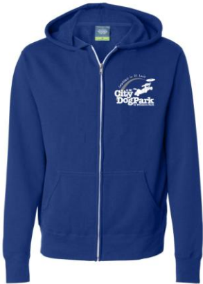
Check Out New Colors & Winter Items