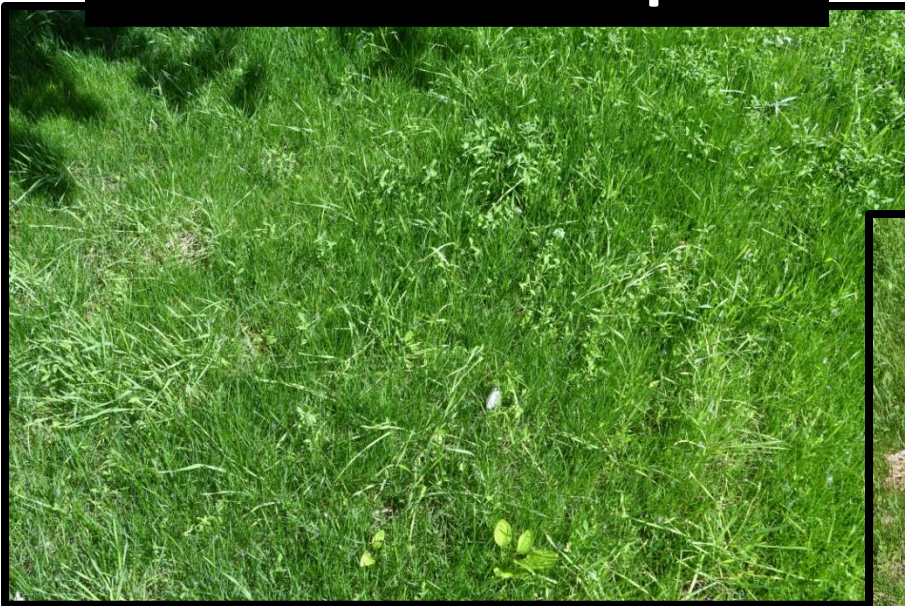
Good Close Up