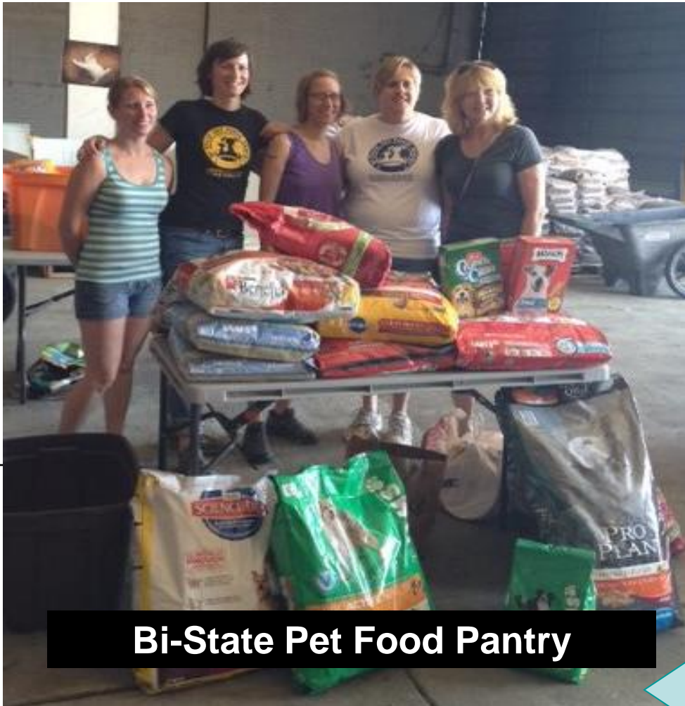
Bi-State Pet Food Pantry