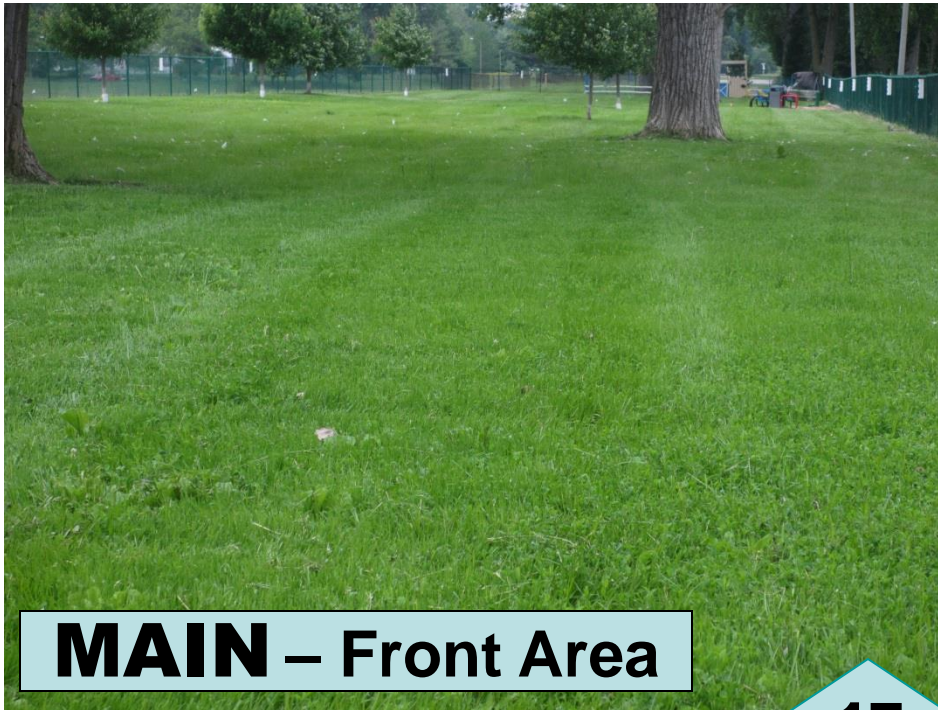
MAIN – Front Area