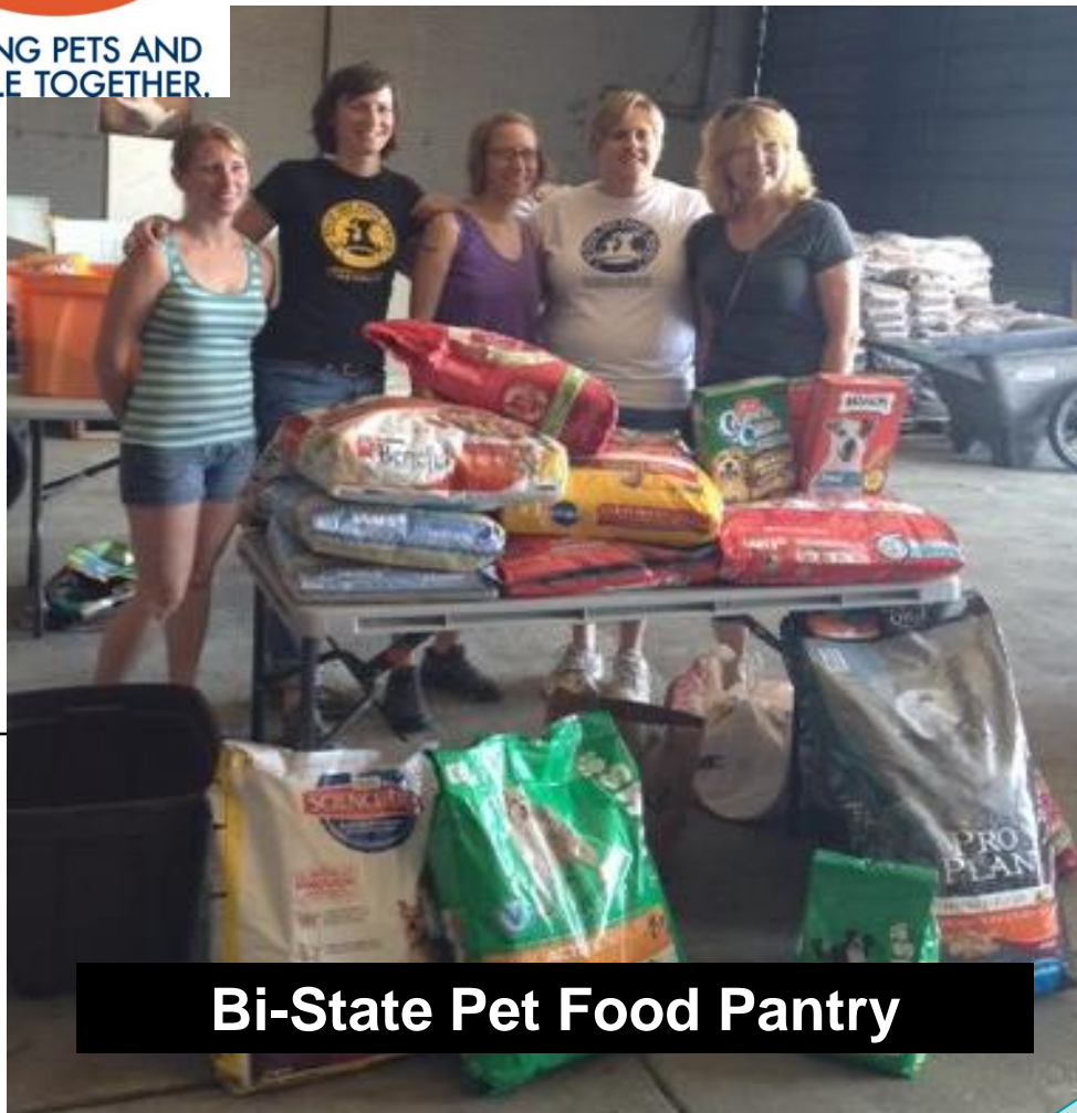
Bi-State Pet Food Pantry