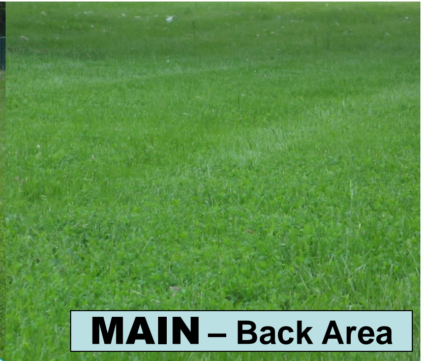
MAIN – Back Area